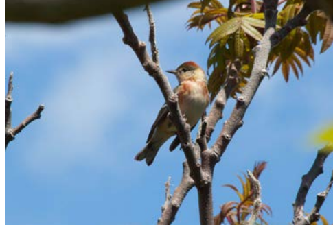
Bay-breasted Warbler by Eric Masterson, 5/27/13, Star Island, Rye, NH.