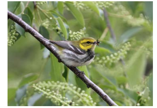
Black-throated Green Warbler by Lauren Kras, 5/23/13, Church Street water tower parking lot, Hampton, NH.

See inside for articles about the fallout, a field trip to Star Island, and the Spring Season summaries.