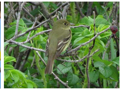
Yellow-bellied Flycatcher, 5/23/13, Great Boar's Head, Hampton, NH.