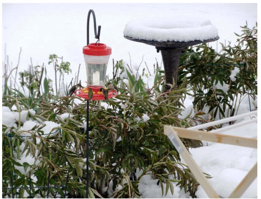
Photo #3. Hummingbirds coming to one of the feeders on May 26 in the snow that had started the evening before.