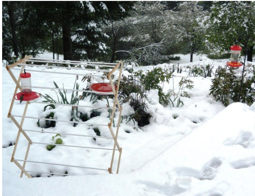
Photo #4. The feeders on the clothes rack after the snow stopped in the morning of May 26.