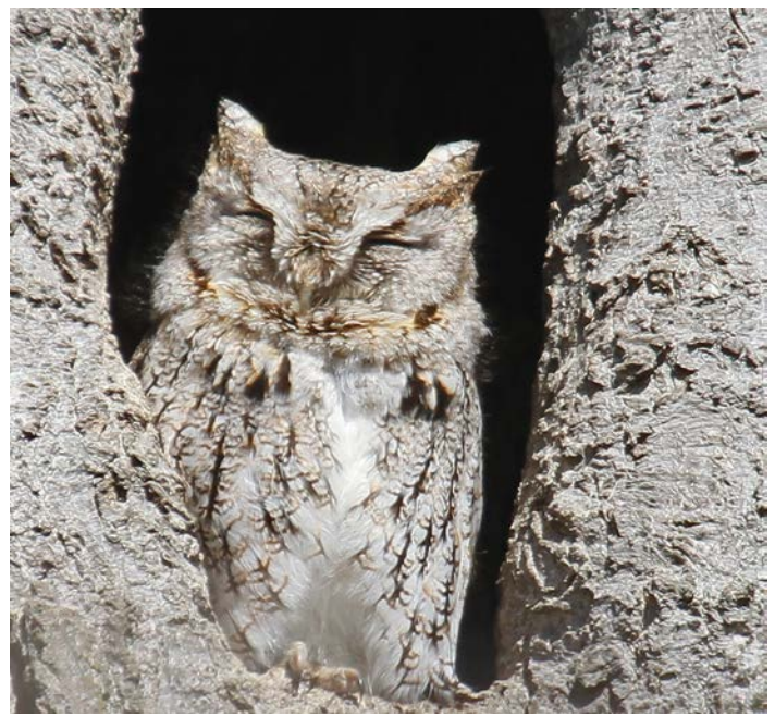
Eastern Screech-owl, 4/6/13, Hollis, NH.

Seven Yellow-billed Cuckoos was above average and hinted at the summer to come. Five reports of Eastern Screech-Owl did not include any from the southeastern coastal plain, the species' stronghold in New Hampshire. The record from Boston Lot Lake in Lebanon was noteworthy for its more northerly latitude. A single report of a Snowy Owl came from Hampstead on March 16. The long-staying Redheaded Woodpecker that spent the winter at a bird feeder in Alexandria was last reported on May 17 (see also page 26).