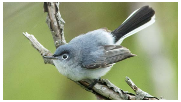
Blue-gray Gnatcatcher by Jen Esten, 5/24/13, Star Island, NH.

n May 24, 2013, we led a group on a Merlin Wildlife Tours field trip to Star Island at the Isles of Shoals to witness spring migration. At best, Star is difficult to plan with groups and even harder to time for the "right" weather conditions. It is always a guessing game as to how your day is going to turn out. Even when the boat can make it out, it's often a total bust for birds, but sometimes you win big, as our group did on this chilly morning.