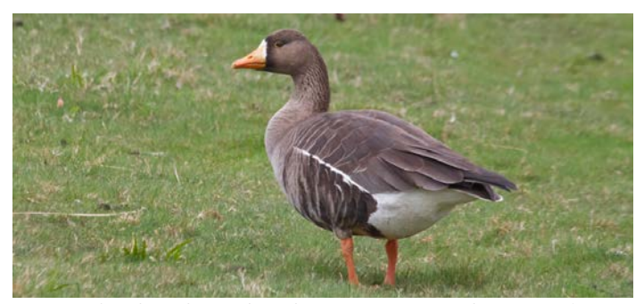
Greater White-fronted Goose, 4/21/13, Liberty Mutual, Borthwick Ave., Portsmouth, NH.

find one before mid-April. This spring's bird, presumably a non-breeder, was exceptionally tardy.