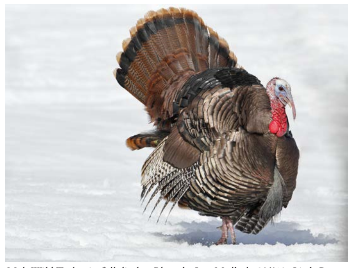
Male Wild Turkey in full display. Photo by Len Medlock, 3/4/13, Little Bay Rd., Newington, NH.