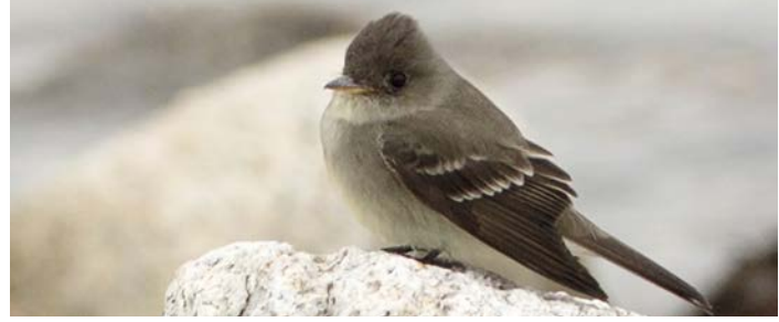
Eastern Wood-Pewee, 5/24/13, Star Island, Rye, NH