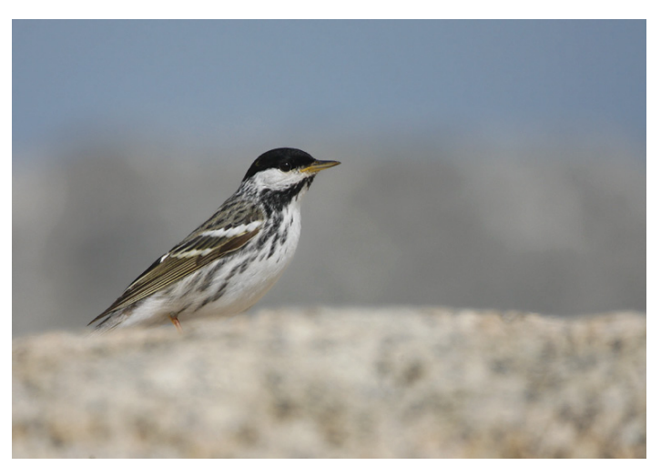
Blackpoll Warbler by Jason Lambert, 5/23/13, Great Boar's Head, Hampton, NH.

a fun moment. Typically, when the wind is from the east or southeast in spring, birds evacuate offshore islands like Monhegan. Many birds apparently did leave, but because the front was still close by to the south and the wind flow wasn't too strong, many other birds were still flying through the frontal boundary and looking for places to come down as they experienced the wind shift. Numbers were also down on Appledore although there were good numbers of Lincoln's Sparrow (24 banded) and as many as 10 hummingbirds were seen at one time.