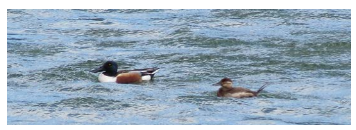
Ruddy Duck (r) with Northern Shoveler, 4/9/13, Exeter WTP, NH.