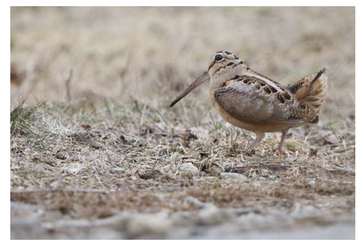
An American Woodcock that appeared on a doorstep in Hampton on 3/2/13. See the Backyard Birder feature for more.