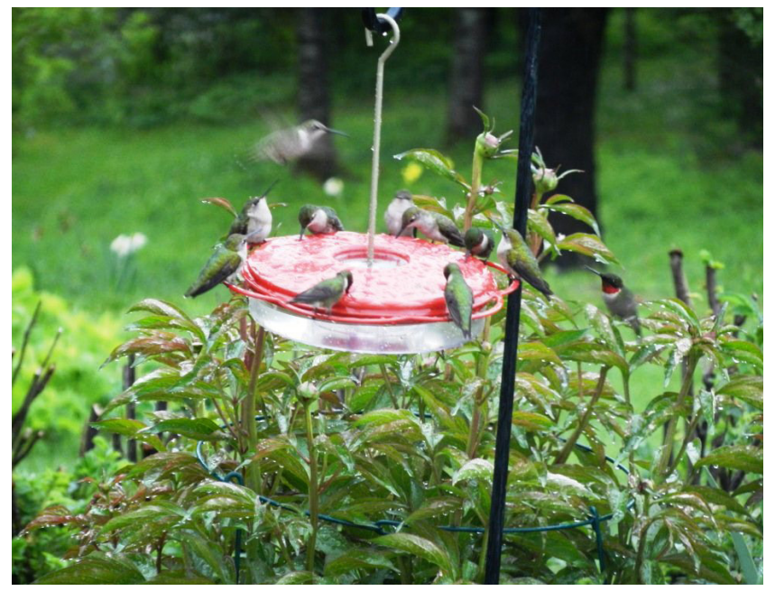
Photo #1. A swarm of Ruby-throated Hummingbirds around the feeders on May 24, the day before the snow started.

umbrella and hung a feeder on the clothes drying rack, the hummers came and fed. I added more feeders to the rack. It stopped snowing around 8:00 am. I relocated the clothes rack to my garden (Photo #3 and #4). The snow melted by the evening of May 26, although we had a hard frost that night. Photo #5, taken on May 27, shows lots of hummers continuing to visit their new "multi-level feeder station." It's so popular, that I may leave it up for the summer!