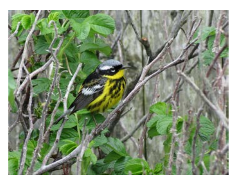
Magnolia Warbler, 5/23/13, Great Boar's Head, Hampton, NH.