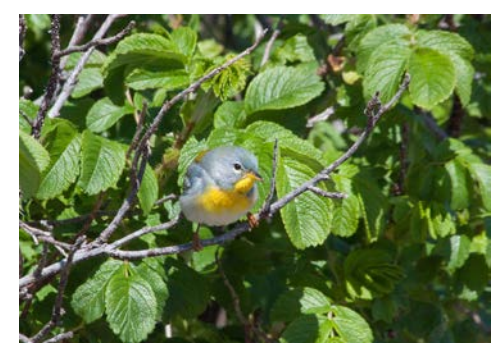
Northern Parula by Eric Masterson, 5/27/13, Star Island, Rye, NH.