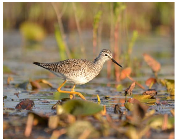
Lesser Yellowlegs by Amanda Altena of Birdathon team We Be Birding, 5/18/13, Salem, NH

The Birdathon is New Hampshire's annual celebration of bird diversity, migration, and the New Hampshire birding community. In 2013, Birdathoners tallied 184 species on the Big Day (down from 190 last year, which ran for the entire weekend), including 25 Conservation Species, a select list of state-listed endangered, threatened, and declining species (four fewer than last year's total). Species such as Least Bittern, Little Blue Heron, Sora, Blue-winged Teal, Caspian Tern, Black Guillemot, Common Nighthawk, Olive-sided Flycatcher, Grasshopper Sparrow, and many others, were counted on May 18.