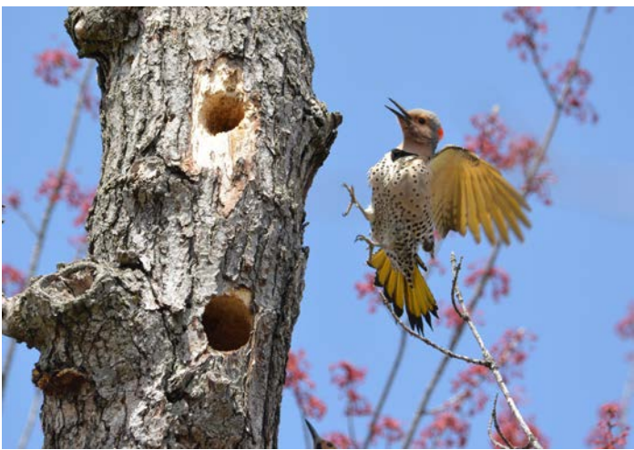
Northern Flicker by Debbie LaValley, 4/29/13, Woodlawn Cemetery, Concord,