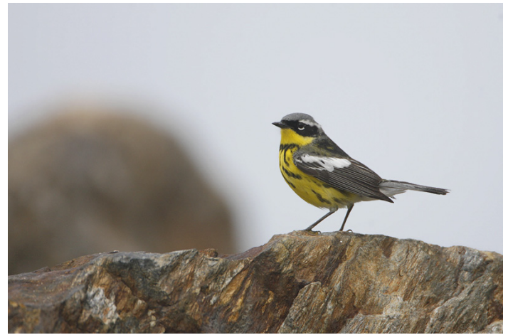
Magnolia Warbler by Jason Lambert, 5/23/13, Great Boar's Head, Hampton, NH

A frontal system that dominated New Hampshire's weather from May 19 through 24 brought the curtain down on a ten-day period of decent weather for migration. The wind shift and unsettled weather grounded migrants along the New England coast, including a spectacular fallout on New Hampshire's coast and islands (see page 23). The event was especially well documented at the Church Street water tower parking lot in Hampton and on Star Island. Notable sightings on Star on May 24 included 17