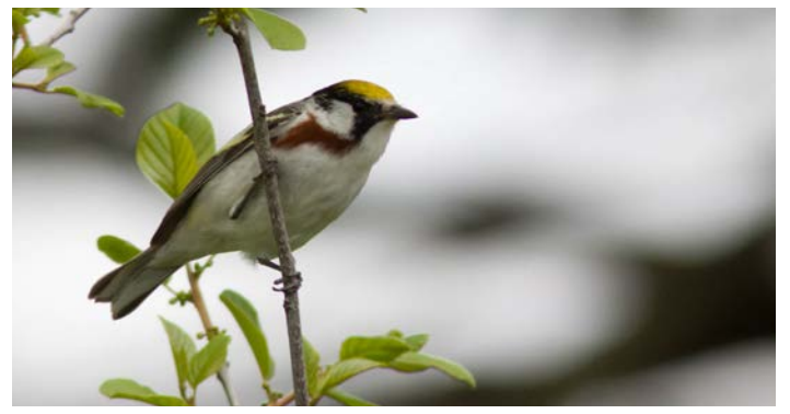
Chestnut-sided Warbler by Benjamin Griffith, 5/23/13, Church Street water tower parking lot, Hampton, NH.

Pallouts of migrant birds in spring are one of the most exciting phenomena a birder can experience. These spring fallouts typically occur on offshore islands and to a lesser extent the coast. Sometimes a concentration of these migrants occurs over small areas well inland. Almost all fallouts are weather related and in New England during spring they are often associated with warm fronts. I don't think there is an official definition of fallout, but when you're walking along a road and need to sidestep the birds at your feet, you know you are amidst one.