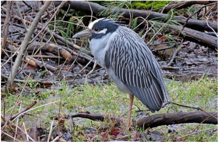
Yellow-crowned Night-Heron by Steve Mirick, 4/13/13, Hampton, NH.

A trip to Star Island on May 24 was chiefly notable for migrant passerines, although a Sooty Shearwater seen from the boat was on the early side. A count of 350 Northern Gannets from the coast on April 28 was an exceptionally high number for the spring.