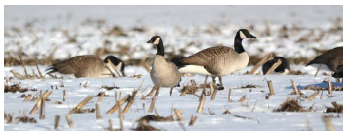
Cackling Goose, 3/24/13, Litchfield, NH.