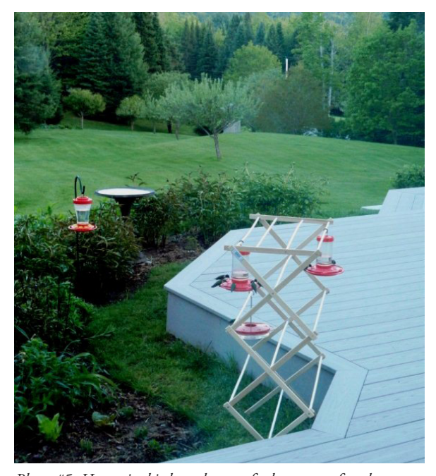
Photo #5. Hummingbirds at the new feeder set up after the snow melted on May 27.

y wife and I spent Memorial Day weekend at our favorite motel, the Four Seasons, at Twin Mountain, NH. The weather was a bit unusual for the time of year with freezing temperatures and snow. Our consternation, however, was minimal compared to the Rubythroated Hummingbirds who had recently returned from their warm winter habitats. Arising to face a cold and snowy May 25, we first headed to Foster's Crossroads, a general store, to pick up a newspaper. Fortunately for the hummingbirds, the store had several feeders hung and filled. The birds were frantically buzzing around which made it difficult to count them, but there was a minimum of eight. Next, we proceeded about a mile south on Route 3 to the Mountain Bean for breakfast. More feeders were available there, which also were swarmed by hummers. Again, I managed to count a total of eight. Returning to the motel, where there was only one feeder, one more hummingbird was counted (motel owner was suitably chastised for only having one feeder ready). Therefore, 17 Ruby-throated Hummingbirds were reported to eBird for a short stretch of Route 3 which, predictably, was received with a bit of skepticism.