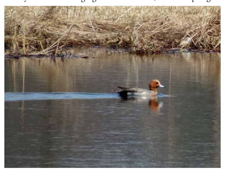
Eurasian Wigeon by Steve Mirick, 4/9/13, East Kingston, NH.

Waterfowl, which move through the state primarily in March, also respond to the weather, though for different reasons. They need open water and/or access to forage, parameters that are determined by the amount of snow and ice cover. A harsh spring might create a bottleneck of birds to the south of New Hampshire, waiting for conditions to improve. When winter occasionally times its retreat north through New Hampshire to coincide with the traditional peak time for waterfowl migration, the ensuing hordes of ducks and geese can be remarkable. In the last few years, we have experienced warm springs which permit waterfowl to overfly the state to staging areas in Canada, and this spring