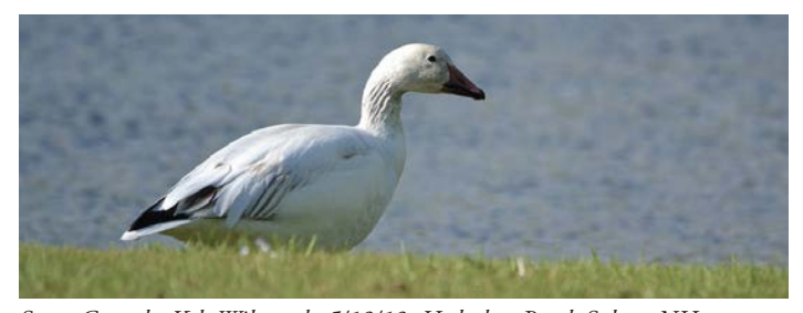
Snow Goose by Kyle Wilmarth, 5/13/13, Hedgehog Pond, Salem, NH.