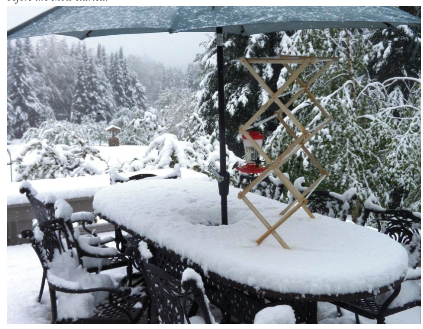
Photo #2. Betsy's successful experiment of hanging a feeder from a clothes rack under the umbrella to keep the snow off the feeder and the nearby perches.